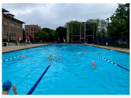
All Chicago Pools On Track To Reopen June 23 After Lifeguard Hiring Surge, Parks Officials Say

Congratulations to the Chicago Park District on this milestone!